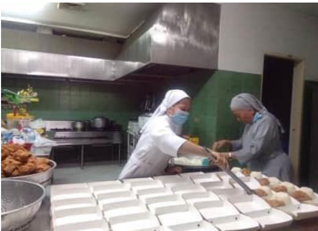
Sisters of St. Paul College Parañaque packing food