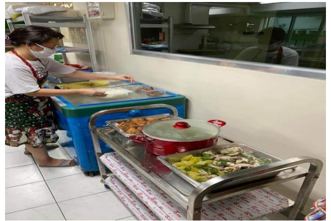
The sisters and personnel cook for the first responders and relief operations of the LGUs of Makati City