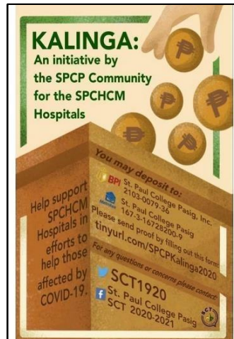
“Kalinga” Fund Campaign for SPC Hospitals