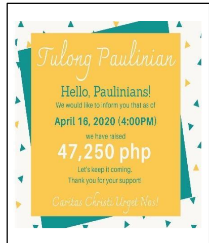
“Tulong Paulinian” of SPC Pasig employees for outsourced employees