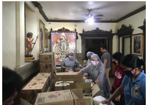
Sisters of St. Paul College of Makati packing relief goods.