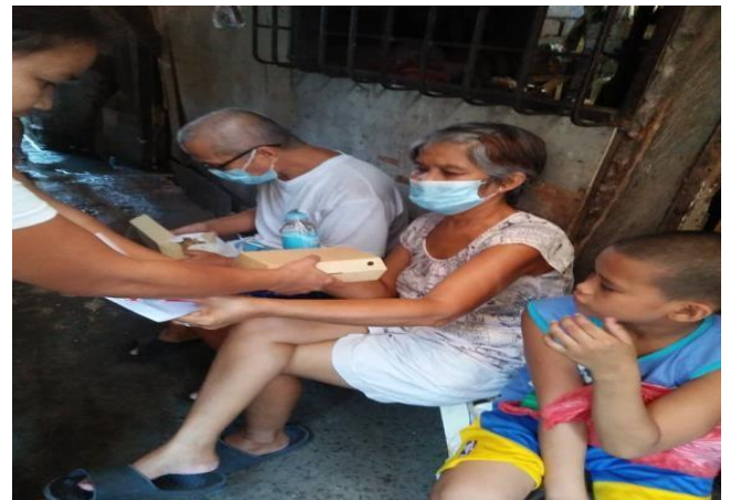
Recipients of the Hapag ni San Pablo Feeding Program